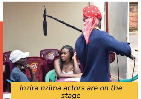
Inzira nzima actors are on the stage

Access to youth friendly health services by using Educational flims is vital for ensuring sexual and reproductive health (SRH) and well-being of adolescents