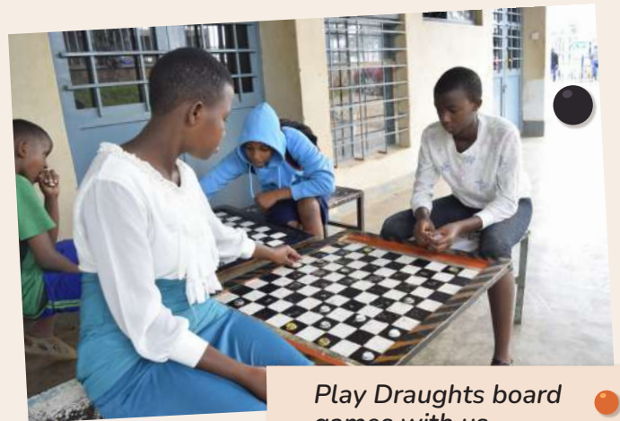
Play Draughts board games with us