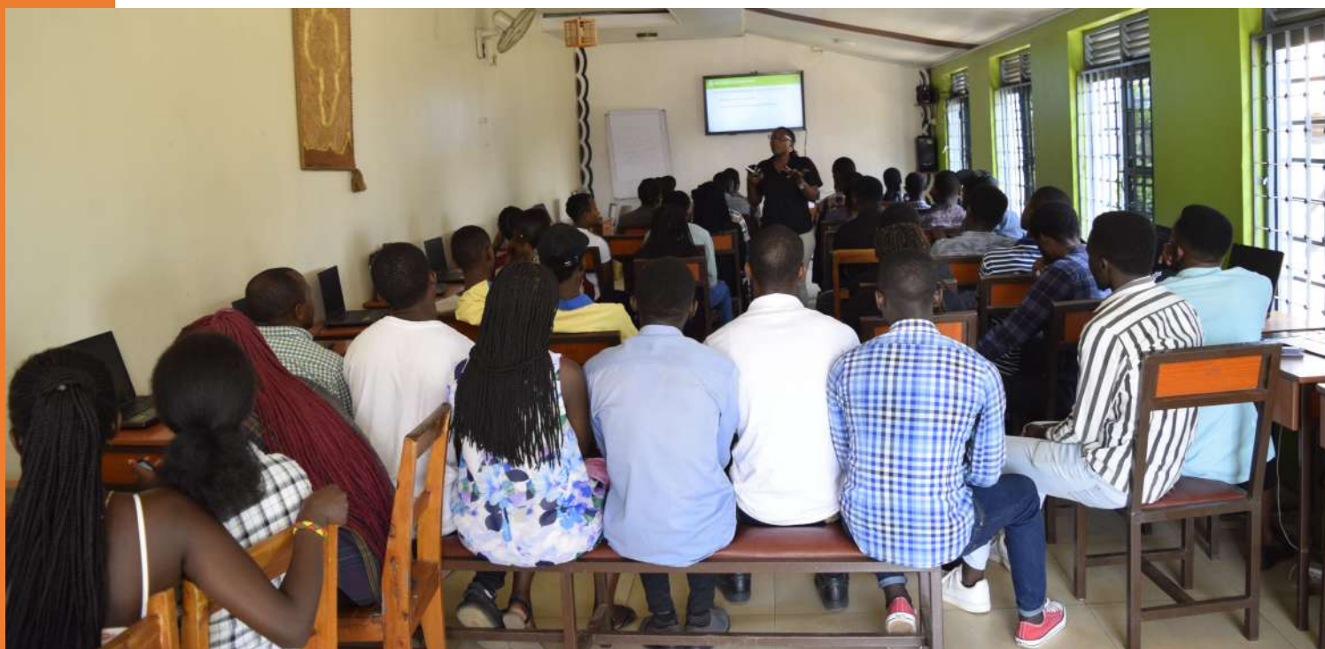
Youth beneficiaries of HARAMBE listen to tutor during the weekly workshop.