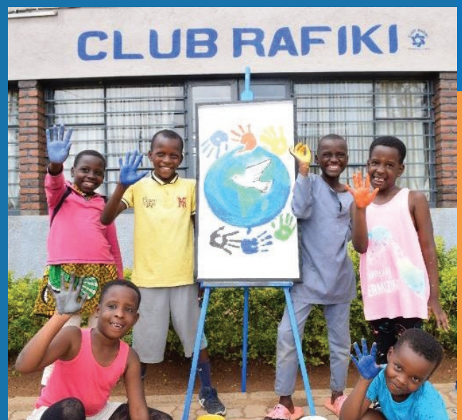
Children displaying illustration that promote a message of peace

During the International World Peace Day on 21st September 2023, about 50 children between the age of 10 -15 years joined effort in the celebration of this day at Club Rafiki. Art work was used as tool to send a message of peace to the community in general, participants did draw different illustration depicting a message of peace by demonstrating that a peaceful community it's a healthy and prosperous community. Children who attended this celebration at Club Rafiki shared ideas and were inspired deeply that they have a role to play as younger generation to promote and spread a message of peace to the world in all the way possible, thus they believe that an illustration can pass a strong message than what words can't say and accomplish.