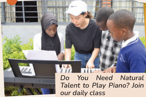
Do You Need Natural Talent to Play Piano? Join our daily class