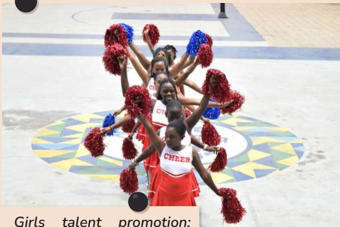
Girls talent promotion: Basketball cheerleading program