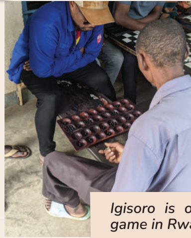
Igisoro is one traditional game in Rwanda