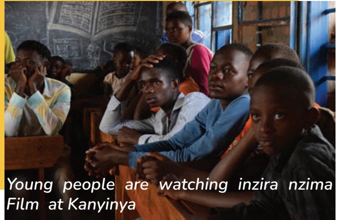
Young people are watching inzira nzima Film at Kanyinya

INZIRA NZIMA (The right way) Is an educational film realized by youth in collaboration with Club Rafiki through a financial support from Friends of Rafiki. Youth, let join our effort by addressing the issues of Sexual Reproductive Health, fight against drugs and others subsistence's abuse, including preventing unplanned and early teen pregnancy so that we may pursue the path that leads us to a better life.