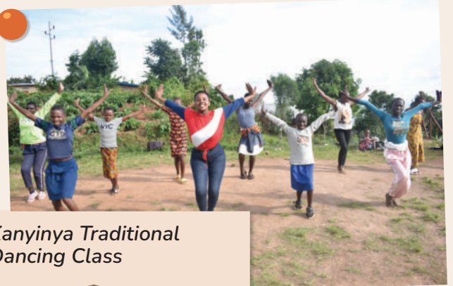
Kanyinya Traditional Dancing Class