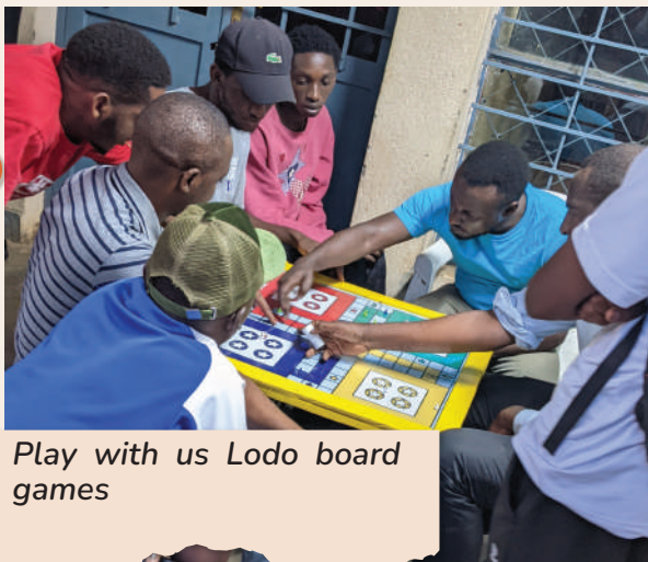
Play with us Lodo board games